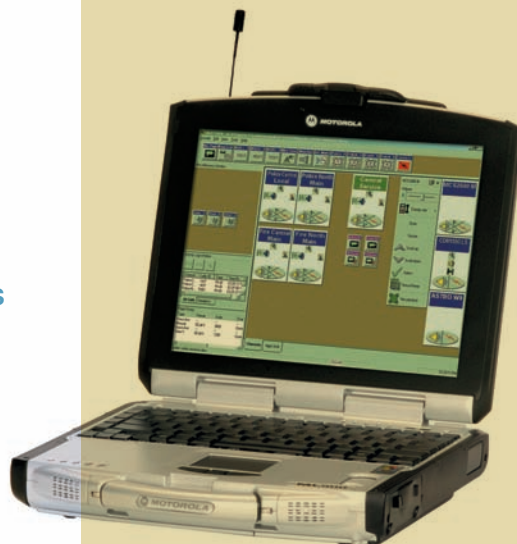
The ML 900: Motorola's most advanced mobile laptop

The MIP 5000 radio console consists of VoIP software and a small MIP 5000 gateway for each radio channel managed. The scalable dispatch solution, with 1, 4 and 8-channel software options, leverages your existing Ethernet network infrastructure, changing dispatch from just one point of contact to many by putting radio communication within the reach of every employee with access to the network. This one application enables communication with conventional and trunked radio systems (UHF, VHF and 800 MHz) and can neutralize the disharmony associated with mismatched proprietary systems, so that all decision makers can quickly and easily weigh in on important issues.