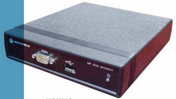
MIP 5000 Gateway

The powerful radio over IP dispatch console application works with all your existing equipment, connecting to any radio to assure that important information gets where it needs to go without interruption. The simple yet elegant solution works on a standard computer, quickly installs in a Windows environment, removes the need for expensive dispatch position cabling requirements and streamlines audio communications, operating via a microphone, a screen and a mouse. Wherever deployed, this efficient, network-enabled console helps lower the cost of ownership by eliminating the need for expensive lease lines while assuring continuous, high-quality communication.